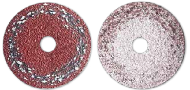
Aluminum material clogging a resin fiber disc. VSM STEARATE Plus with visibly less adhesion.